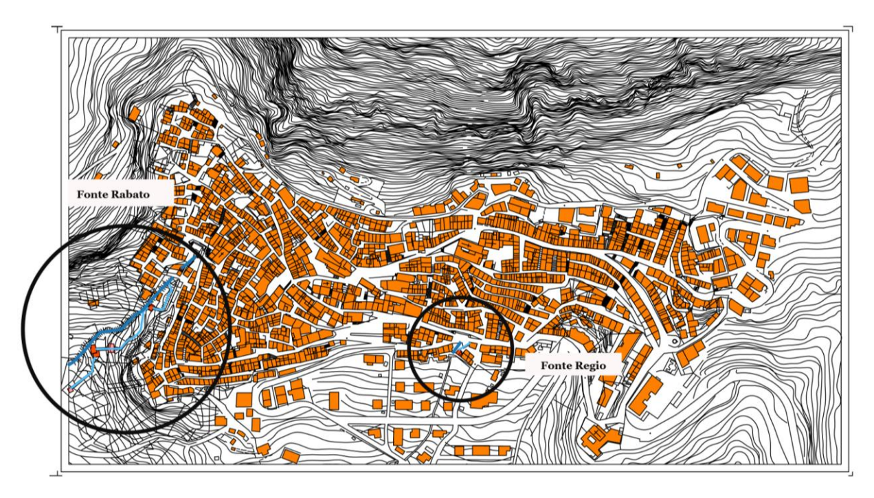
Fig. 8. Historic Castronovo showing the location of the two fountains, Fonte Rabato and Fonte Regio.