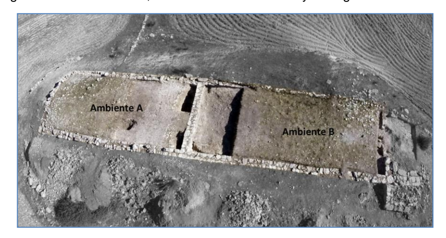
Fig. 4. Monte Kassar 2016, Int 7: overhead photograph taken by a drone, showing the three components of the casermetta: Building A (Ambiente A), Building B (Ambiente B) and the tower (lower right). The deep holes in Building A and at the entrance to Building B, represent late intrusions emptied during the present campaign.

the characterisation of the structural remains as a casermetta <sup>5</sup>. The analysis of the stratigraphic sequence and the study of the structure in 2016 have allowed three components of the buildings to be identified (fig. 4).