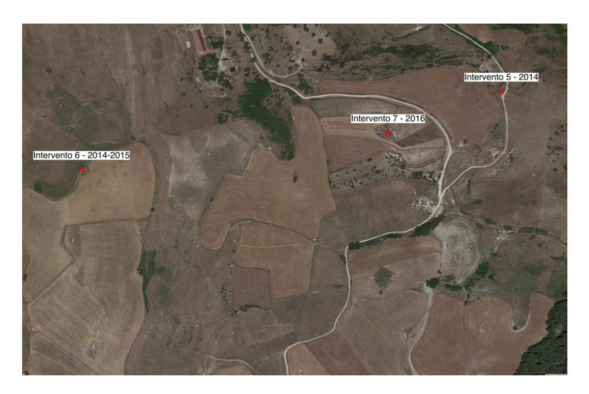
Fig. 3. Monte Kassar showing the location of investigations to 2017.

The report that follows presents the results of the 2016 season at Castronovo, comprising the findings at the four main sites, plus brief summaries of research in progress in ceramics, faunal remains and special finds by those responsible. Finally we assess the significance of the 2016 investigations and look to the next stage.