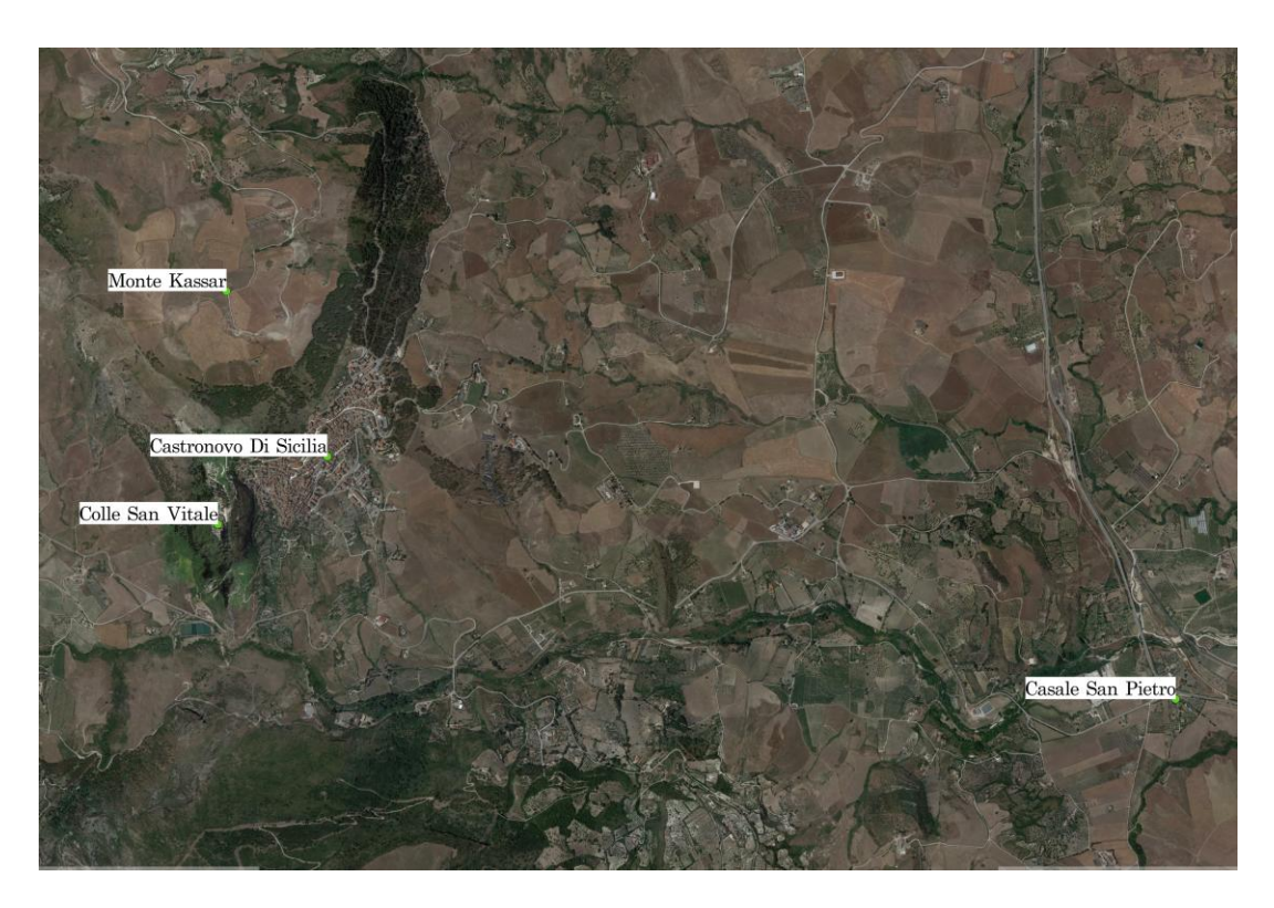
Fig. 1. The Castronovo region with an indication of the areas investigated to 2016.

paign was initiated in 2014 and continued in 2015<sup>2</sup> and 2016. During 2016, these investigations became a pivotal part of a wider project funded by the European Research Council, SICTRANSIT, which seeks to understand the character of economic, environmental, and domestic change during the 6<sup>th</sup> to 13<sup>th</sup> centuries CE over the Sicilian island as a whole<sup>3</sup>.