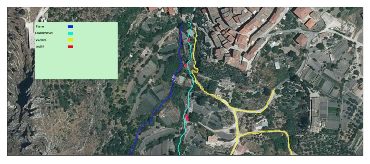
Fig. 9. Model of the hydraulic system in the valley below Fonte Rabato. In blue: river; in yellow, lines of natural drainage; in green the artificial water channel; In red: mill sites.

portant node of development has been the mother church dedicated to the Holy Trinity, constructed between 1381 and 1404.