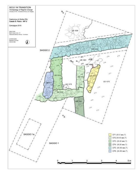
Fig. 11. Plan at the end of the 2016 season, showing the walls encountered and their preliminary dating.

The 2015 test trench, which measured 2 x 5m (Int 5, Saggio 1), made contact with a sequence of settlement strata provisionally assigned to the 10^{th} - 12^{th} century<sup>13</sup>. On this basis it was decided to extend the excavation in 2016 with a contiguous area measuring 5 x 6m (Int 5, Saggio 2; fig. 11). Here we encountered a structural sequence, which, with some gaps, encompassed a period from the late Antique to recent times. At its base were deposits of natural fluvial sand and gravel, encountered at a depth of c. 1.5–1.8 m from the current ground level. Over this developed the first period of human occupation (Period I), consisting of several layers containing highly fragmented material datable to the 3^{rd} - 4^{th} century. Defined at the top of these levels was a stub of wall CF1, which is provisionally regarded as contemporary with them.