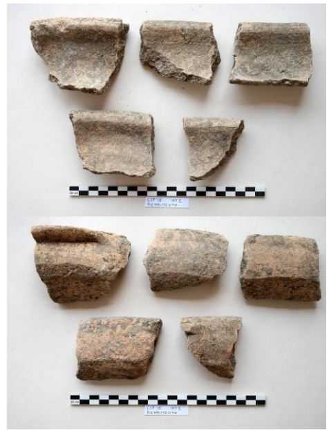
Fig. 17. Casale San Pietro, Int 5: late Antique and early medieval sherds from US1024.