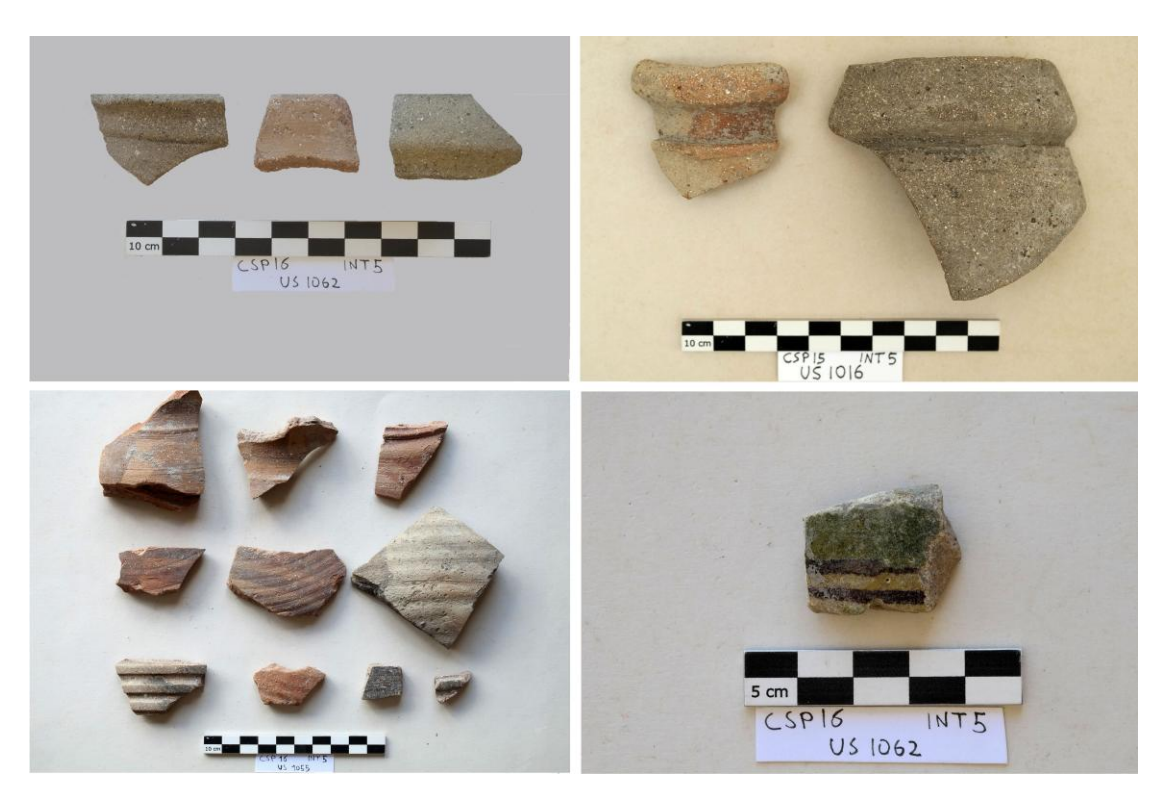
Fig. 19. Casale San Pietro, Int 5: Pottery from the 10<sup>th</sup> century. a (top left): sherds from globular pots in calcitic fabric b (top right): jug. c (bottom left): painted and rilled amphorae. d (bottom right): fragment of a glazed bowl.

The destruction layers at the end of Period II (US 1015, 1016, 1055, 1062) produced many examples of pottery belonging to the Islamic period: globular pots with thick out-turned everted rim and rilled body in a calcitic fabric (fig. 19a); a jug with thick vertical rim with parallels in 10<sup>th</sup>century Palermo (fig. 19b)<sup>21</sup>; fine-ware amphorae painted in red with rilling on the body and a thin rib in relief around the neck; two rims of painted amphorae of Angelo Type B1/B2<sup>22</sup> and Ardizzone Type A17<sup>23</sup> (fig. 19c), and a sherd belonging to a glazed bowl with decoration painted in green and brown (fig. 19d). In general, glazed pottery is rare in these levels. The tiles belonging to the destroyed buildings are large with smooth pitted surfaces, sometimes decorated with straight or curvilinear incised lines by using the fingertips. The mode of manufacture differs from those found in Monte Kassar: these tiles have a dark reduced core with a final red re-oxidation on the surface.