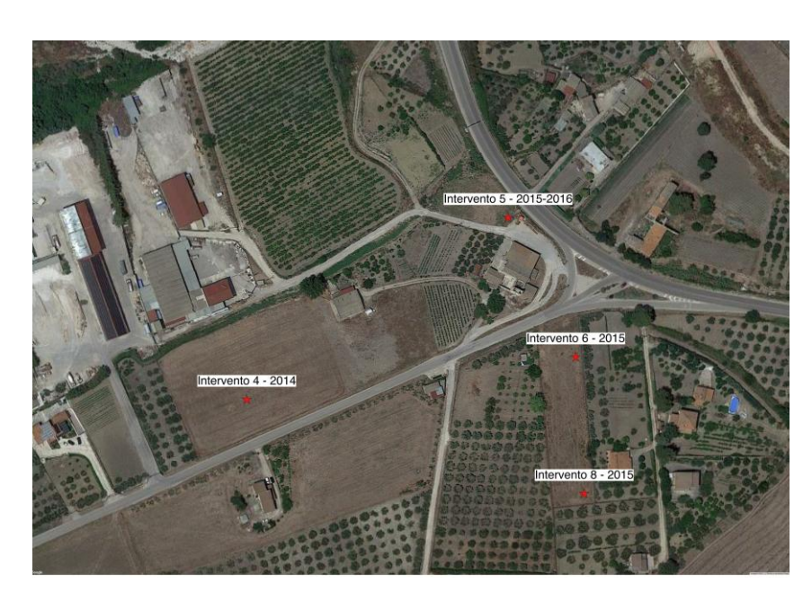
Fig. 10. The area of Casale San Pietro showing the location of the four interventions to 2016.

Casale San Pietro today consists of a multiphase building standing in the angle between the main road connecting Palermo and Agrigento (SS189) and the old Palermo road leading to Castronovo. The building includes the nave of a church, now deconsecrated and recently restored, where an early burial of the Islamic rite was contacted<sup>12</sup>. Investigations in the area have included surface collection and geophysical survey in the field to the west (Int 4, 2014), and trenches both in this field and in one to the south (Int 6, 8, 2015) (fig. 10). In 2015 we also excavated a test trench to the north of the church (Int 5), which proved extremely productive and was enlarged in 2016 to an area excavation that forms the subject of this report.