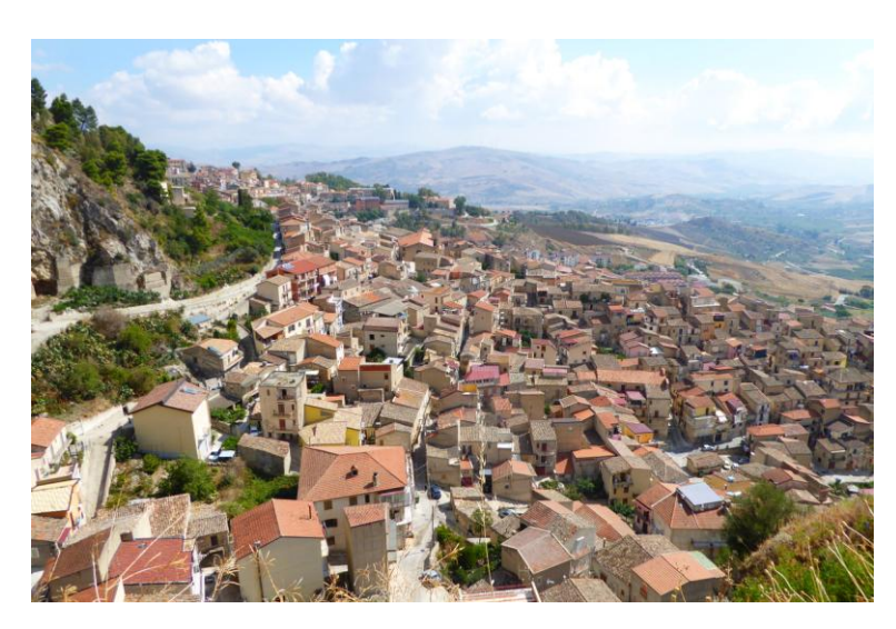
Fig. 7. Castronovo, viewed from Colle San Vitale.

In the current state of research, the structures that have been brought to light cannot be dated precisely. However, the few sherds associated with the abandonment of the buildings are attributed to the early middle ages8. The assemblage of roofing debris recovered from the final collapse layer included tiles decorated with a