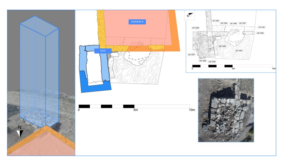
Fig. 5. Surviving elements and reconstruction of the tower standing at the corner of Building B.