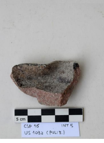
Fig. 21. Casale San Pietro, Int. 5: pottery from US1032, dated to the Norman period (Period III).

calls the 'Peacock Ware' in circulation in the 10<sup>th</sup>-century. Associated with this assemblage was a circular baking tray ('testello') made of soft stone of a type known in Malta ( globigerina )<sup>25</sup>.