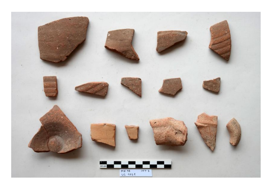
Fig 16. Monte Kassar: fragments from Building A (US1021).

and become prevalent during the course of the same century<sup>18</sup>. The variety and character of tiles found in the demolition layer of Building A signals a roof composed of recycled material, possibly erected at the beginning of the 8<sup>th</sup> century. There was a total absence of finds from the preceding Building B and its tower.