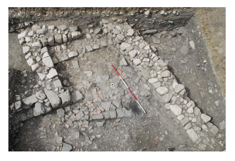
Fig 12. The courtyard of the Islamic period seen from the east. The stub of the levelled wall from the Late Antique settlement (centre, below) was reused as part of the paving.