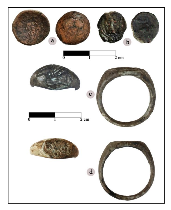
Fig. 22. Special finds: the coins and the rings.

pattern. One carries the image of a bird with a hooked beak (c) and the other a quartet of ring-and-dot ornament (d). These are attributes of Byzantine jewellery and can be generally bracketed between the 4<sup>th</sup> and 7<sup>th</sup> century CE<sup>37</sup>.